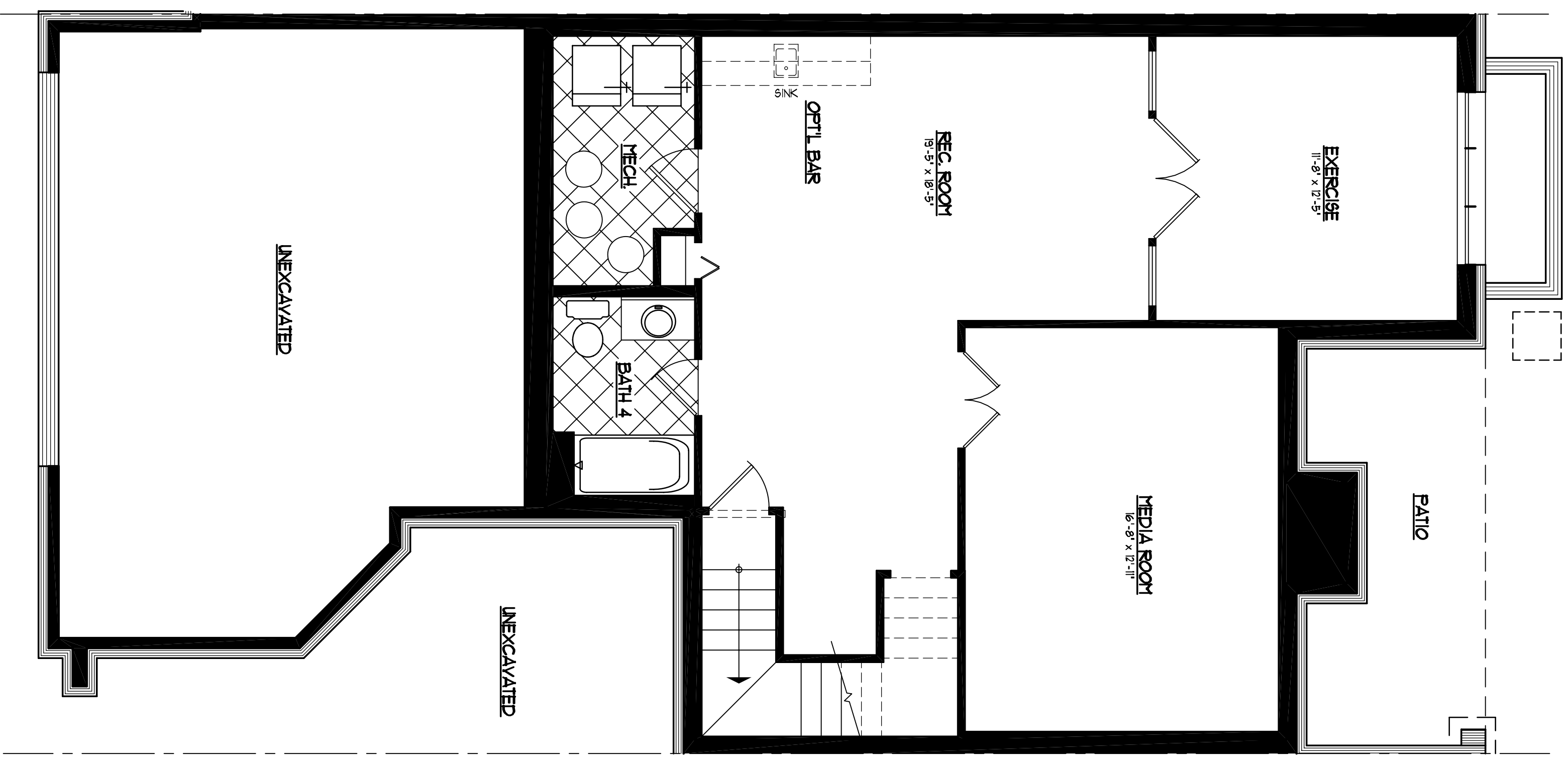
OPTIONAL FINISHED BASEMENT SCALE: 3/16" = 1'-0"